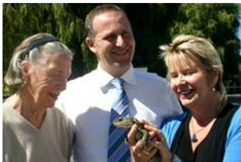
Tuatara Breeding programme with Diana Lady Isaac and Prime Minister John Key

Labour's scheme placed a high burden on households through large increases in the price of petrol and power. It also encouraged businesses to go offshore by imposing high costs, and not giving them enough time to adopt greener technologies.